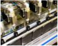
Data Management & Analytics

Efficiently collect, analyze, distribute and visualize large volumes of real-time and historical production data to optimize processes and for more informed decision making.